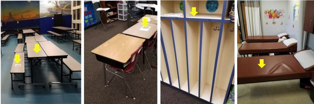
Figure 1. Surfaces in classrooms, a nurse’s station, the cafeteria, a shared kitchen and a physical therapy room were swabbed to quantify bacteria, yeast and mold levels before disinfection, following manual disinfection, and again following the use of the Clorox® Total 360® System. Examples of sites swabbed are indicated with yellow arrows.

Five high-touch surfaces per room were swabbed, including chairs, desks, door handles, soap dispensers, toilet seats, water fountains, light switches and other commonly touched objects present in the rooms (Figure 1). Levels of viable bacteria, yeast and mold, were quantified using standard microbiological techniques and are reported here as colony forming units (CFUs). Statistical analysis was performed on all data using Minitab® 18.1.